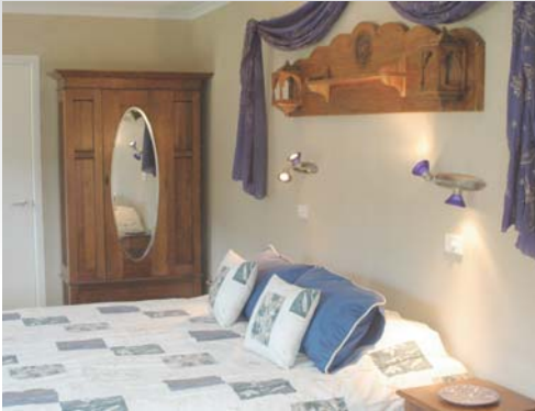
Mountain Seas Retreat accommodation