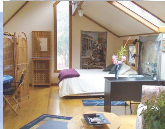
Mountain Seas Studio accommodation